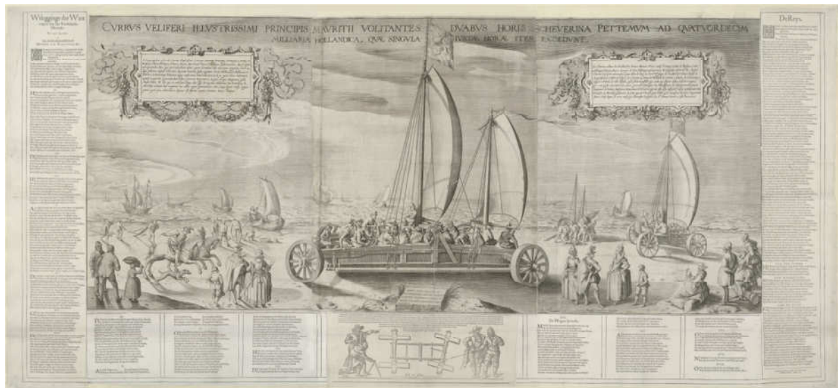
Figure Six After Jacques de Gheyn II Sailing Cars, Engraving, with text by Hugo Grotius Rijksmuseum, Amsterdam