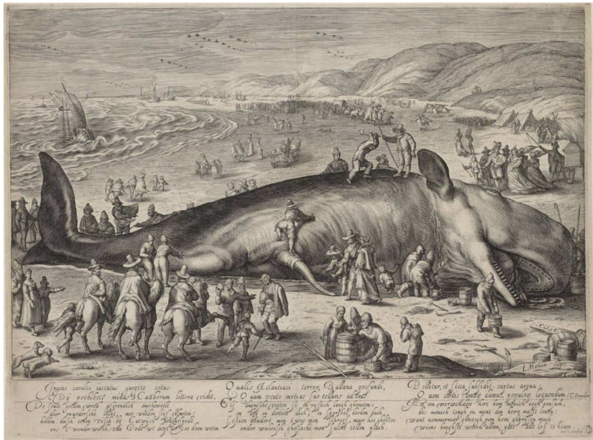
Figure One Jacob Matham A Sperm Whale Beached near Berkhey on 3 February 1598 Engraving, with text by Theodore Schrevelius Museum Boijmans van Beuningen